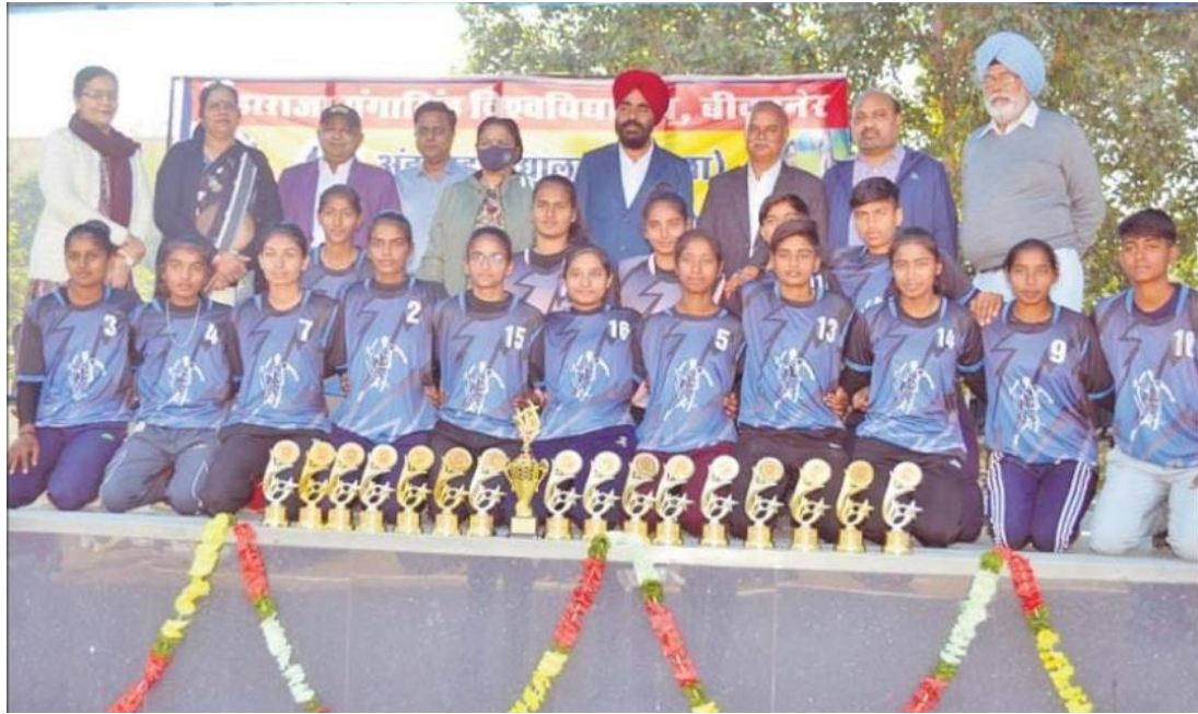
MGS University , Bikaner Inter-College Table Tennis Championship 2021-2022