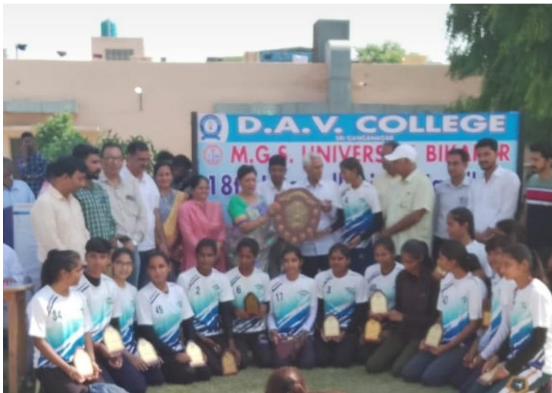
Hand Ball Team with MGS University Championship 2022-2023