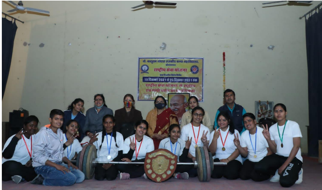
MGS University ,Bikaner Inter-College Powerlifting Championship 2021-2022