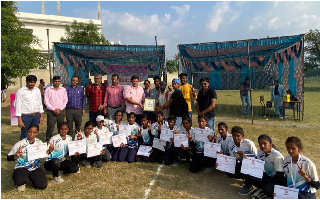
Soft-Ball MGS University Runner -up Team : 2022-2023