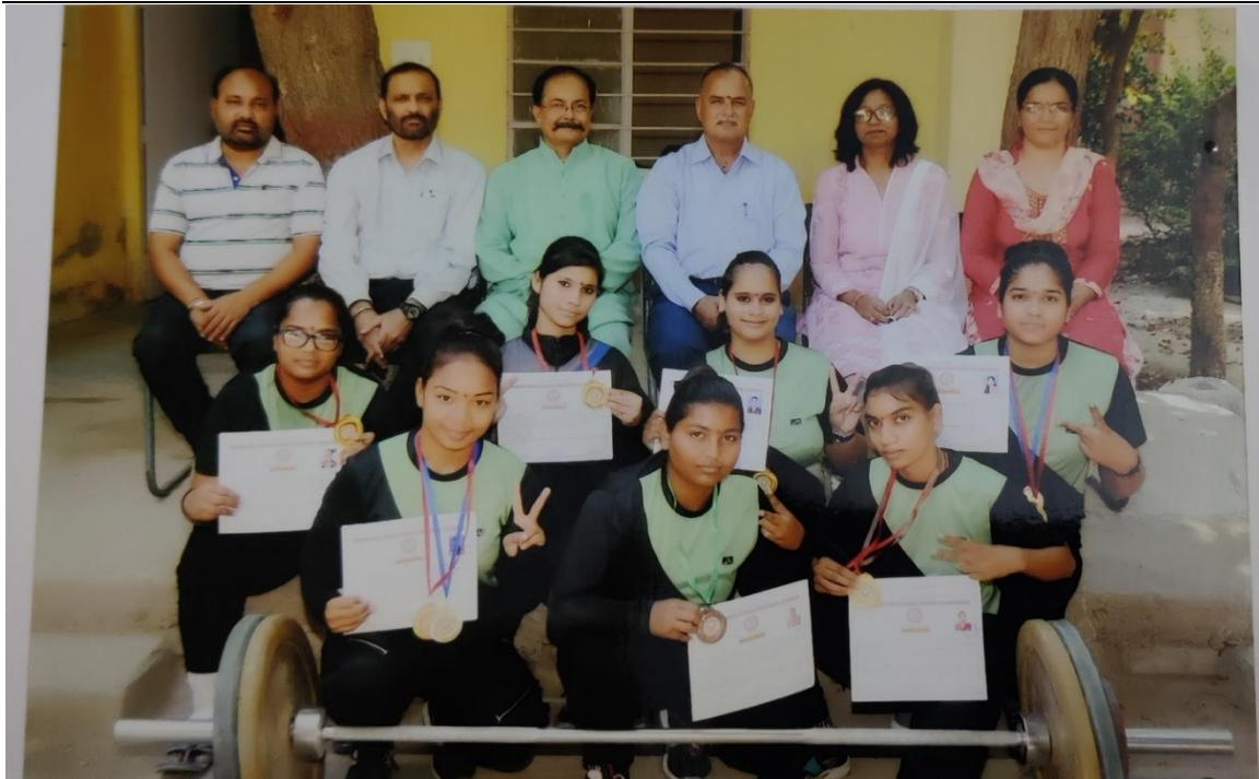
MGS University Powerlifting Championship 2018-2019