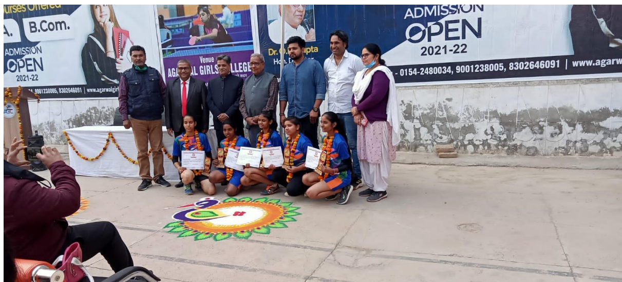
MGS University , Bikaner Inter-College Table Tennis Championship 2021-2022