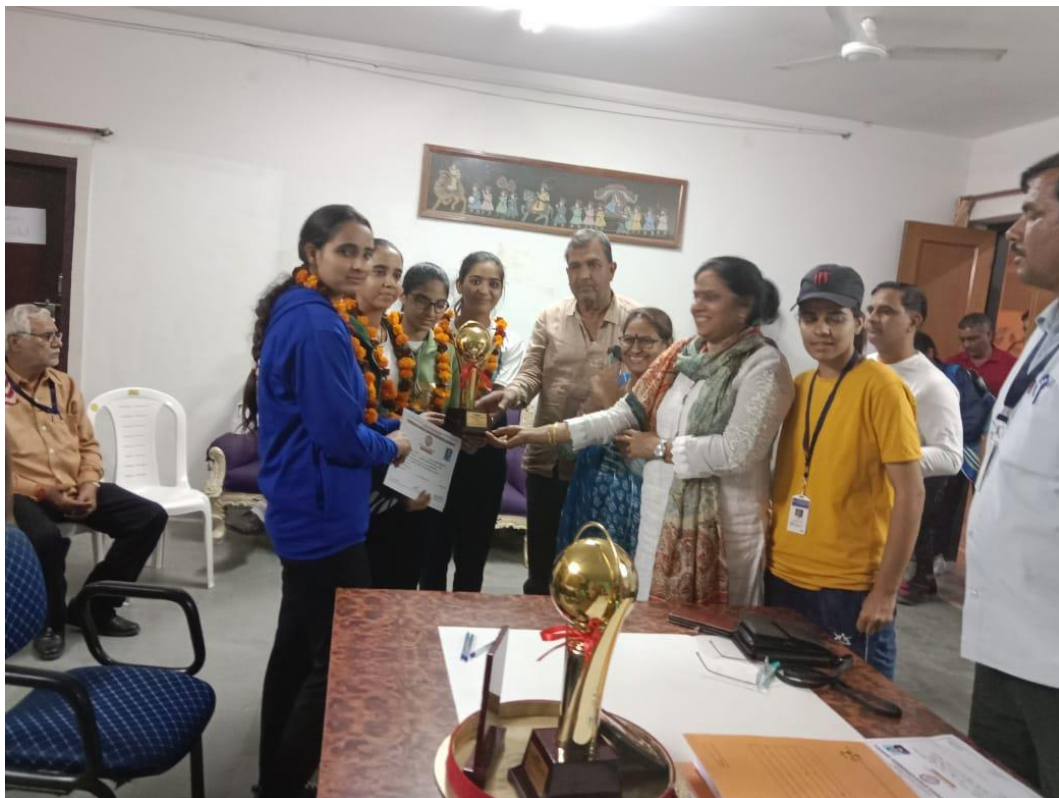
Badminton Players with MGS University Championship:2022-2023